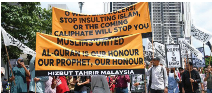
The Shabab are marching to Dutch Embassy after the Friday Prayer.