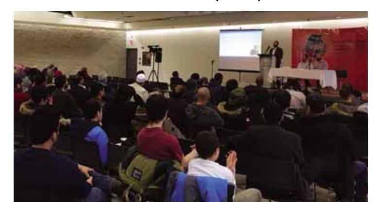
Saturday, 27 Rajab Muharram 1439 AH corresponding to 14 April 2018 CE

The popular revolutions in the Arab lands have failed to create real change. In some countries, the corrupt regimes have changed their skin, but their essence has remained. In other countries, the regimes are still clinging to power, untouched. The popular uprisings against tyranny and corruption created an opportunity to initiate real change, but the Ummah missed it because it did not realize that removing these regimes, without embracing a comprehensive project for the future of the entire Ummah, will create a vacuum that will be filled by the colonial powers. Adopting a comprehensive project for the future, built on the Islamic Aqeedah, must come first, ahead of any attempt at change if the Ummah has any hope of succeeding. Only the Khilafah project has the foundation and the scope to address successfully the challenges that the Ummah faces.